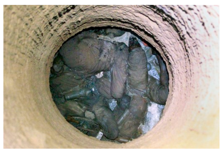
Bodies in a well in Sévaré: Who are they? Who dumped them there?