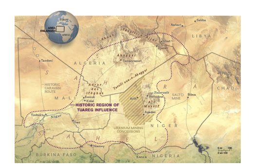
Map by National Geographic (click on image for larger version)

It's notoriously difficult to count nomads, so we cannot know precisely how many Tuareg live in Mali, or anywhere for that matter. The <u>CIA World Factbook</u> estimates that the "Tuareg and Moor" account for 10 percent of Mali's population. The Malian government doesn't collect statistics on its citizens' ethnic affiliations, but it does sometimes ask what languages they speak. <u>Figures from the 2009 census</u> suggest that about 3.5 percent of Malians speak Tamasheq, the language of the Tuareg, as their mother tongue; in the country's three northern regions (Timbuktu, Gao and Kidal), Tamasheq speakers account for about 32 percent. They probably constitute a majority in the