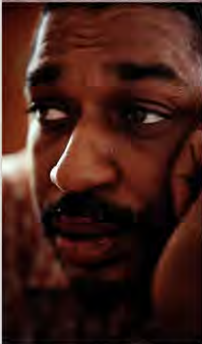
budgets depend on money from forfeiture.